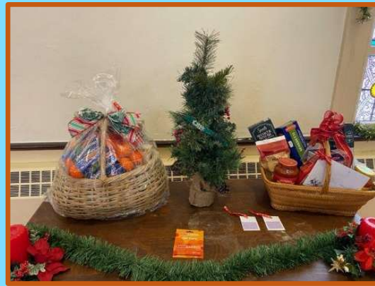
Gifts for our Christmas Family